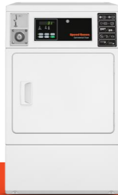
SDENXA / SDGNXA

Vend Operated Rear Control Dryer – Coin Drop