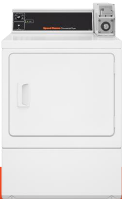
SDESXR / SDGSXR

Vend Operated Rear Control Dryer – Coin Slide