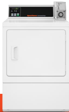
SDENXR / SDGNXR

Vend Operated Rear Control Dryer – Coin Slide