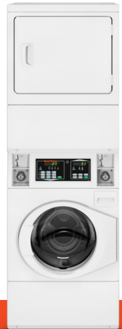
STENXA / STGNXA